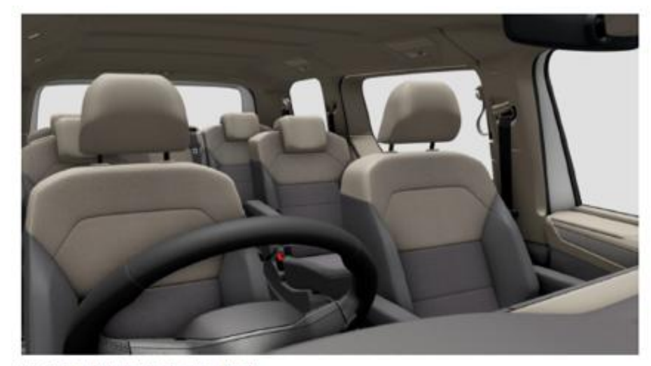
Seat trims "Ribella" in bi-colour fabric (standard on Life)