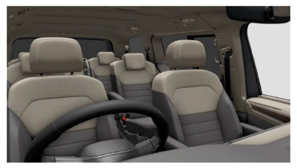
Seat trims 'Savona' in bi-colour leather (optional on Life) (optional on Style)