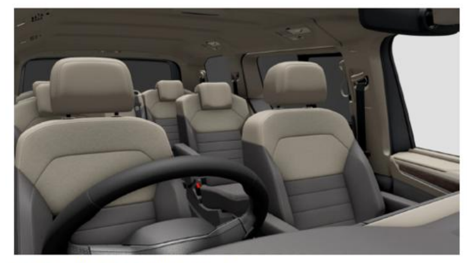
Seat trims 'ArtVelours' in bi-colour microfleece (standard on Style)