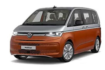
Deep Black / Fortana Red* Mono Silver / Energetic Orange*