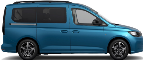
Costa Azul Metallic