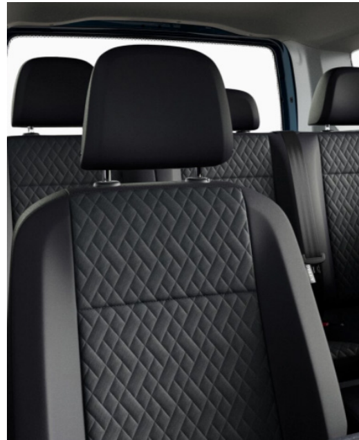
"Trialog" fabric Standard