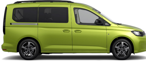
Golden Green Metallic