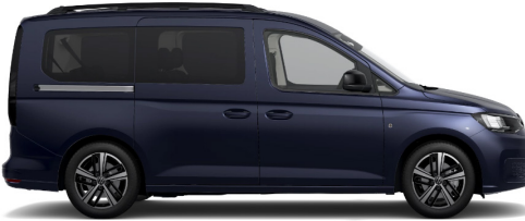
Starlight Blue Metallic