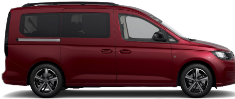
Fortana Red Metallic