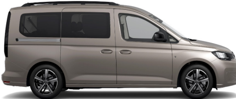
Mojave Beige Metallic