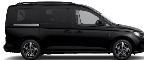
Deep Black Pearl