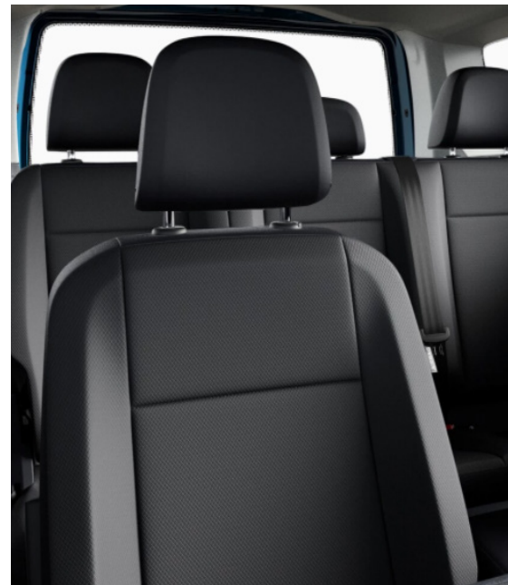
"Pure Diamond" leatherette Optional