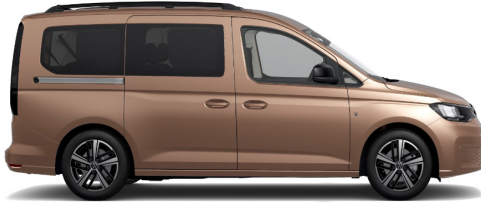
Copper Bronze Metallic